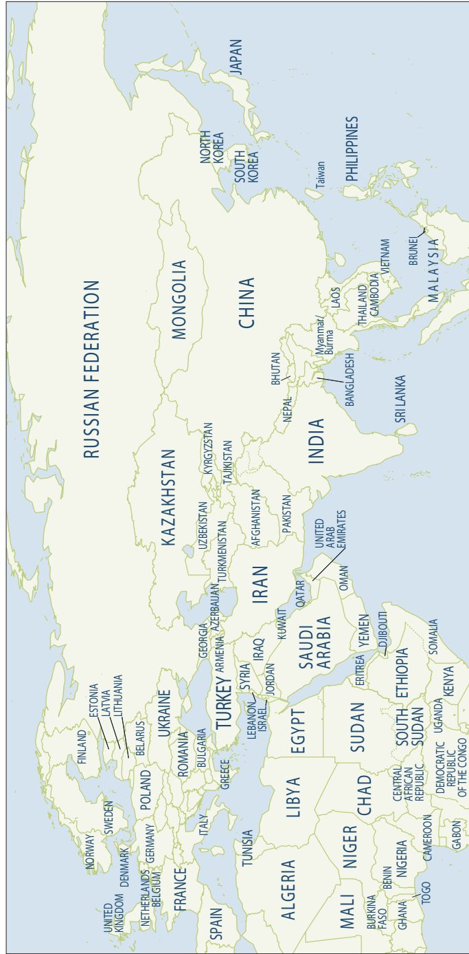
Map of Eurasia and North Africa